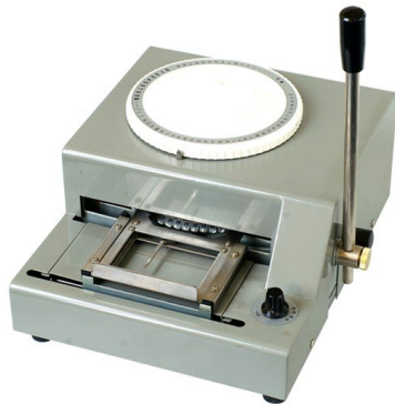
5. WL-160 gilding machine